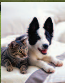
Max, Resort Pet Director